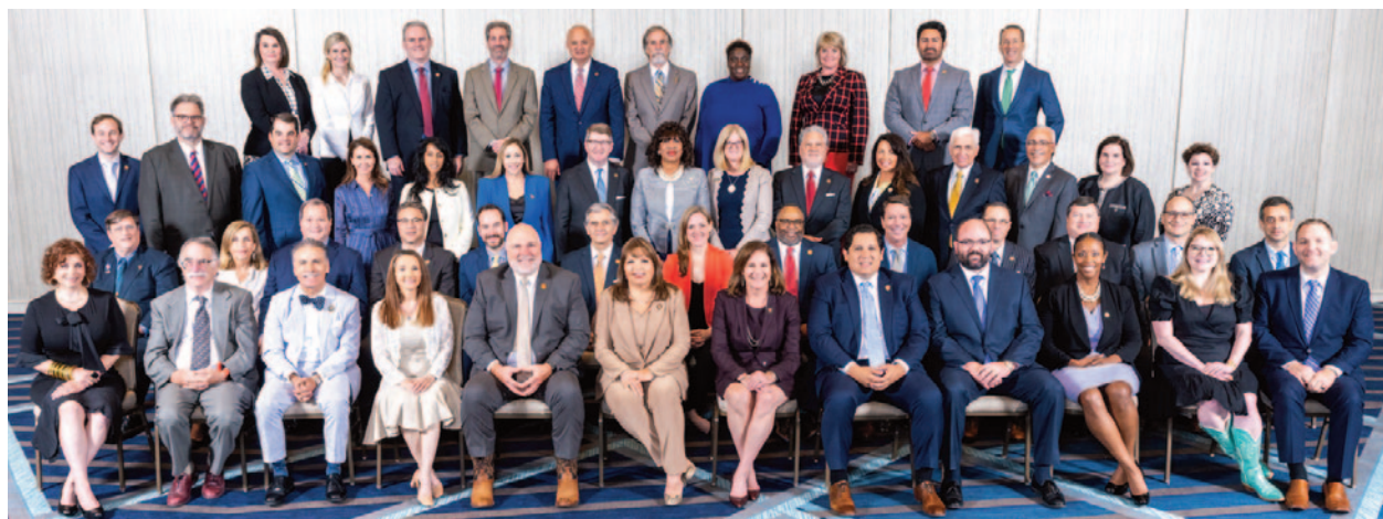
STATE BAR of TEXAS ★ 2021-2022 BOARD OF DIRECTORS

The board's Discipline & Client-Attorney Assistance Program Committee conducted a review of the report of the Task Force on Public Protection, Grievance Review, and the Client Security Fund. The Redistricting Task Force recommended no changes to the bar districts this year. Finally, the Building Planning Special Committee continues to study possible uses for the bar's property at 1415 Lavaca St. in Austin.