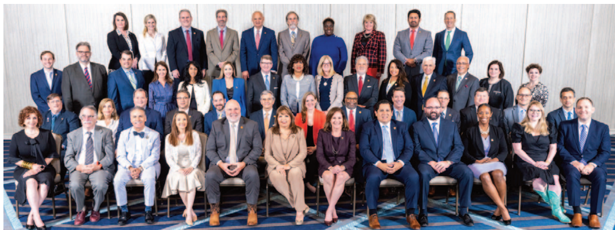
STATE BAR of TEXAS ★ 2021-2022 BOARD OF DIRECTORS

The board's Discipline & Client-Attorney Assistance Program Committee conducted a review of the report of the Task Force on Public Protection, Grievance Review, and the Client Security Fund. The Redistricting Task Force recommended no changes to the bar districts this year. Finally, the Building Planning Special Committee continues to study possible uses for the bar's property at 1415 Lavaca St. in Austin.